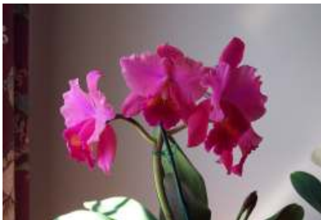
CATTELEYA: A8531—SLC: Jeweler's Act "Tiara" (LC.Drumbeat x SC.Doris) Plant purchased from Elmore Orchids Knoxville, TN. When purchased, the plant had only one stem with one flower in bloom and one stem with buds. This is the bud stem now in bloom with 4 large, fragrant blooms. From K. Smith's home collection of orchids.

ORCHIDS have been called the aristocrats of flowers. The Cattleya Orchid Group is "the" orchid to the popular mind — the prom or corsage orchid. This particular Cattleya (Jeweler's Act "Tiara") is an unifoliate type having fat pseudobulbs and leathery leaves. Cattleyas are sun lovers and do well indoors in a west or south window. During the 1950s and 1960s, the only orchids available were the blooms to be used in corsages for very special occasions .